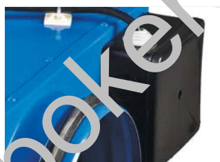
External terminal box for power supply

Mounting at any angle to wall is performed with fastening bracket supplied with the unit. The fan is powered through the external terminal box. Electric supply and mounting shall be performed in compliance with the manual and wiring diagram on the terminal box.