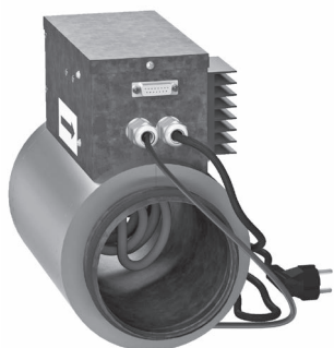
Duct heater for supply air post-heating with external control